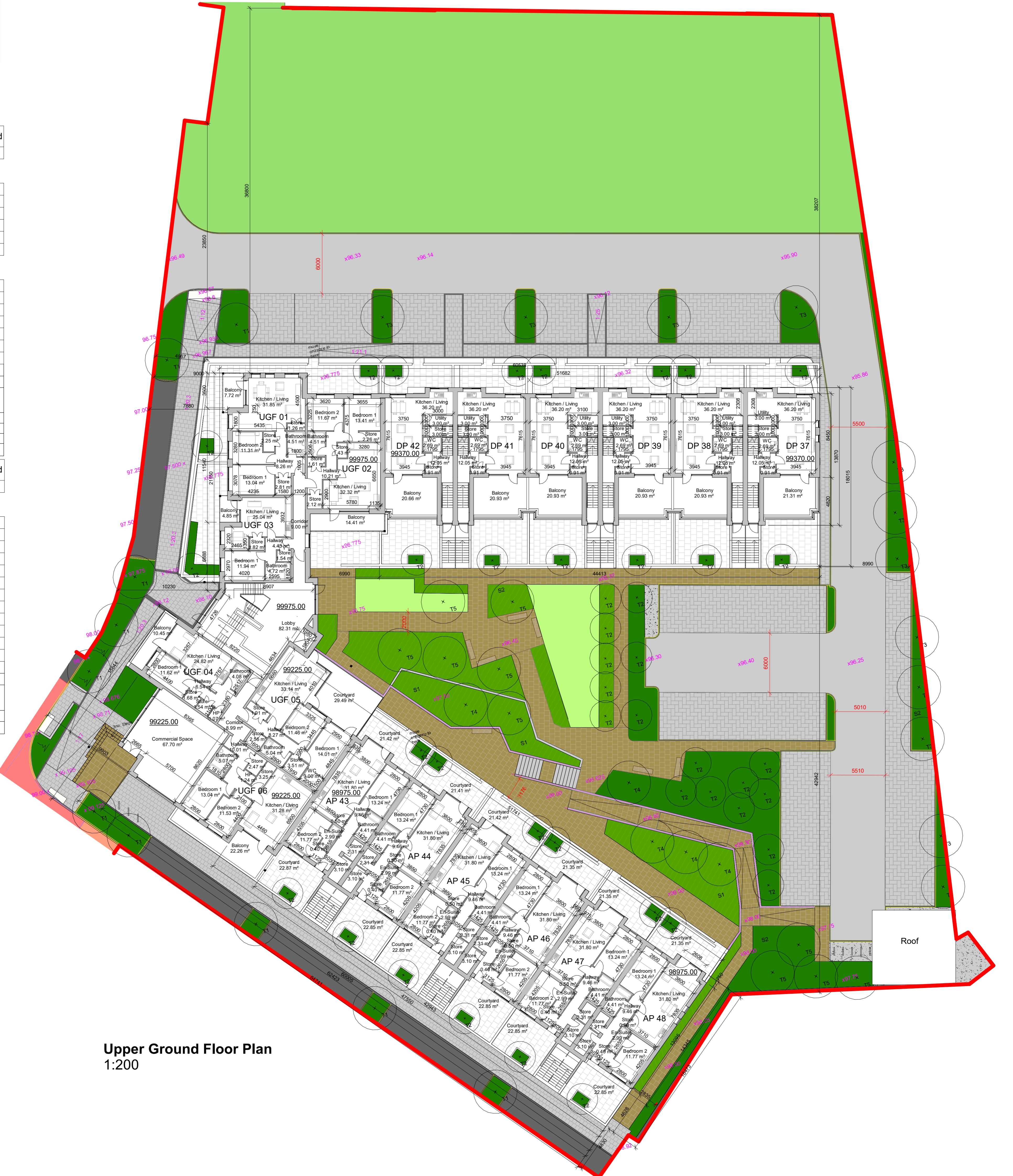
Upper Ground Floor Plan 1:200